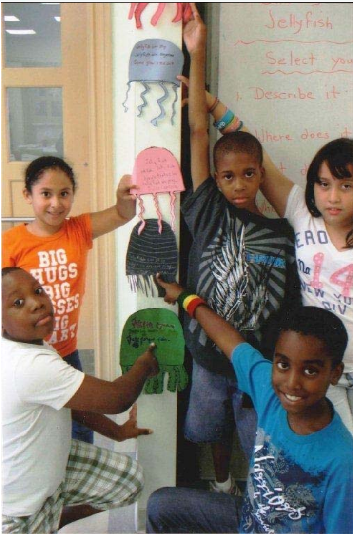
Above: Sharing our haiku jellyfish poetry.