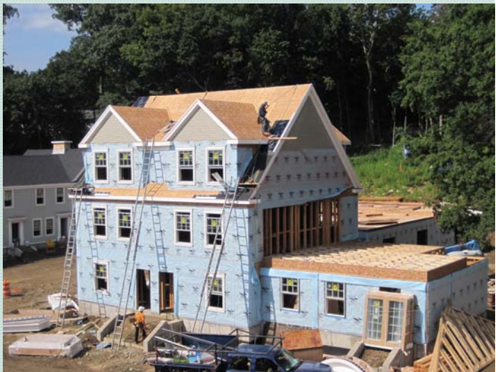
Above are recent photos of the construction activity at Palmer Square.