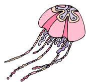
Below: Mural about life on Long Island Sound.