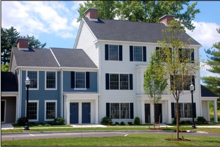
Phase I of Westwood is complete and looks absolutely spectacular. Residents have begun the move in process.