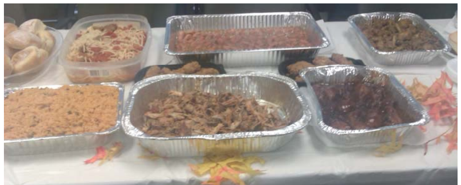
These pictures were taken at the Post House/Taylor Street Pre-Thanksgiving Potluck Dinner held on Thursday, November 17th at Post House.