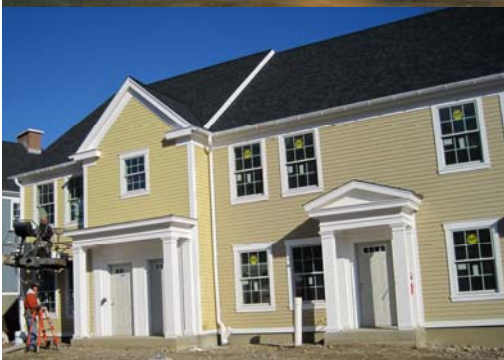
The top and left pictures show the construction progress to date at Palmer Square. The photo on the right shows one of the kitchens with beautiful granite countertops.