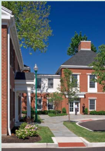
Top right: Westwood which is comprised of 95 units; Bottom right: Palmer Square which has 76 units; Bottom left: A view of Fairgate which has 90 units.